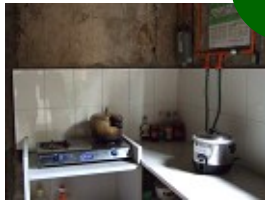
GHG reduction projects scrutinized by PEAR